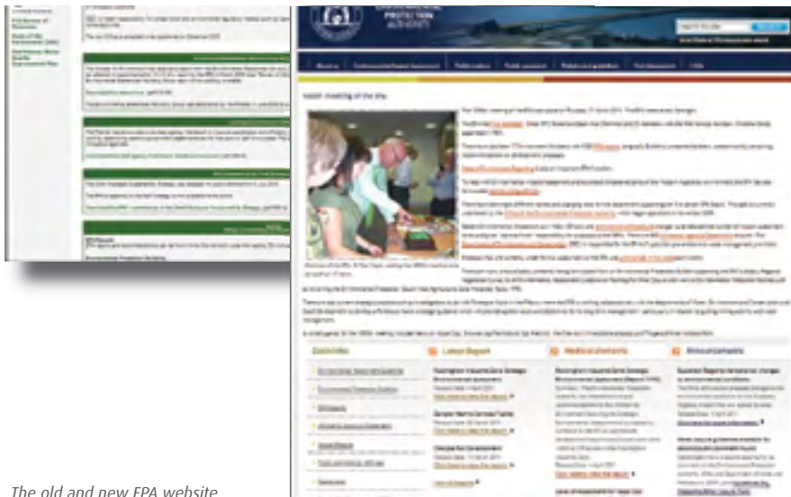
The old and new EPA website homepages

The following page lists EPA Reports produced since the beginning of 2011. New Reports will be listed quarterly in future newsletters. ■