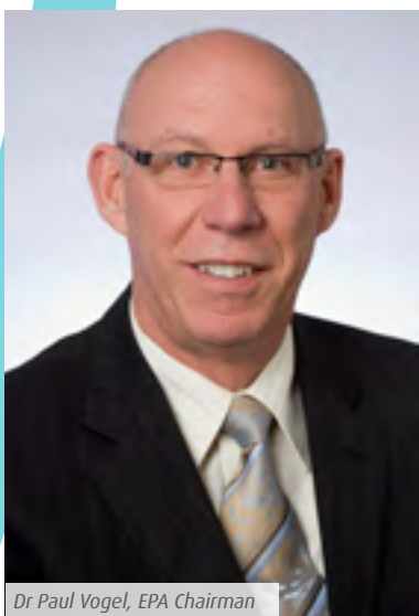
Dr Paul Vogel, EPA Chairman

There are also four uranium mining proposals in the system and eight proposals where significant marine dredging will be required for port infrastructure. There are about 200 million cubic metres of dredging approved or in the pipeline in WA. If you placed all that spoil in one cubic metre boxes and placed them end to end, they would go around the Earth five times! ▶▶2