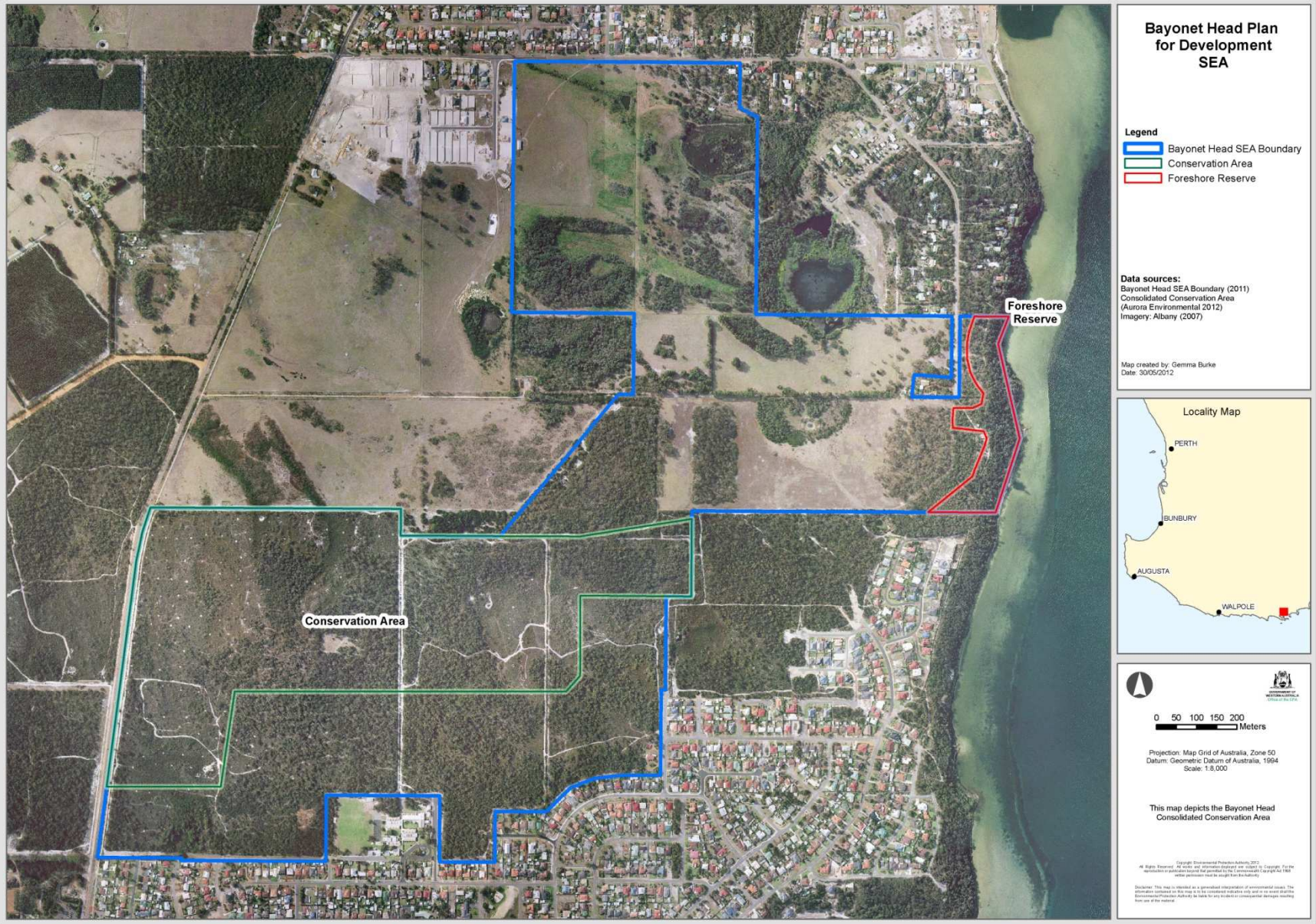
Figure 1: Conservation Area and Foreshore Reserve Boundary