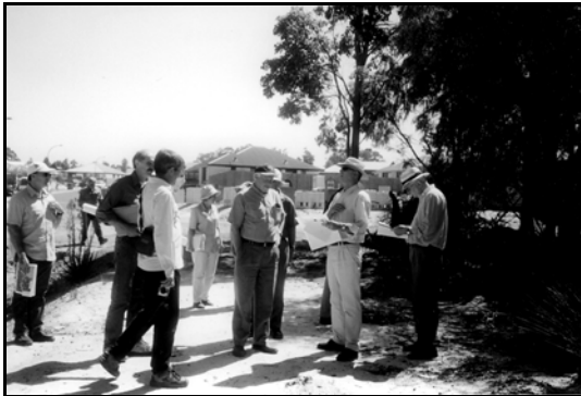
EPA Site visit to ‘Riverslea’ east of Margaret River

The action concerned the assessment by the EPA of the “Riverslea” development east of Margaret River. The proposal was referred by a third party following the grant of subdivisional approval by the WA Planning Commission but before the interim approvals from the council had been obtained. The EPA decided to assess the proposal outside the 28 day time limit.