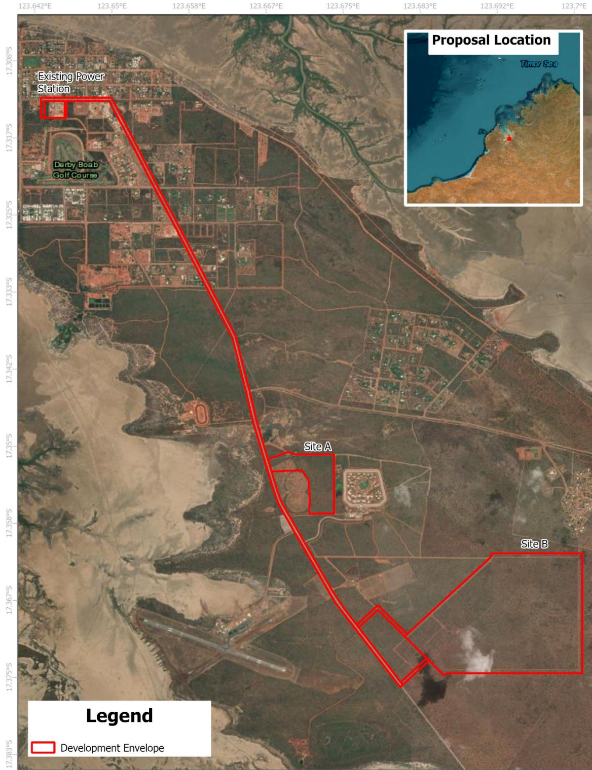
Figure 1 | Proposal Location and Development Envelope