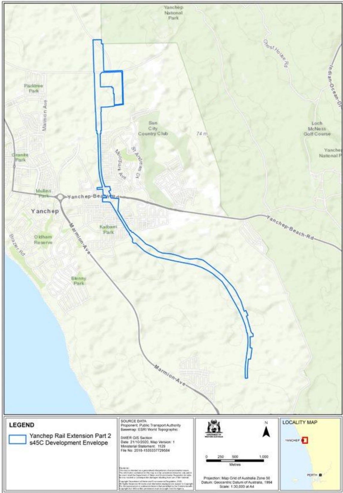
Figure 1 Yanchep Rail Extension Part 2 – Eglinton to Yanchep development envelope.