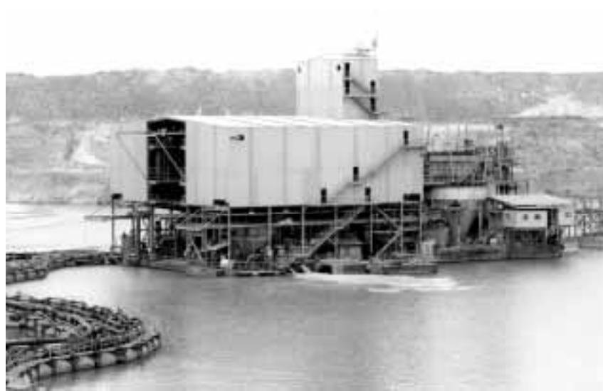
EPA site visit to Tiwest Cooljarloo Mineral Sands Mining Operations. Photograph: South Mine Concentrator

The EPA has endeavoured to provide a guide to the operational interpretation of the National Strategy on land clearing. This has been undertaken through a preliminary Position Statement, released for