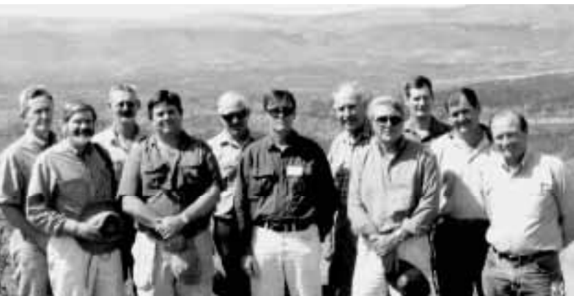
EPA site visit to Hope Downs Iron Ore mine proposal.