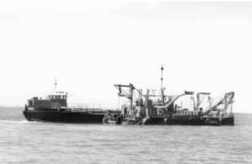
Cockburn Cement Shellsand Dredge operating in Owen Anchorage.