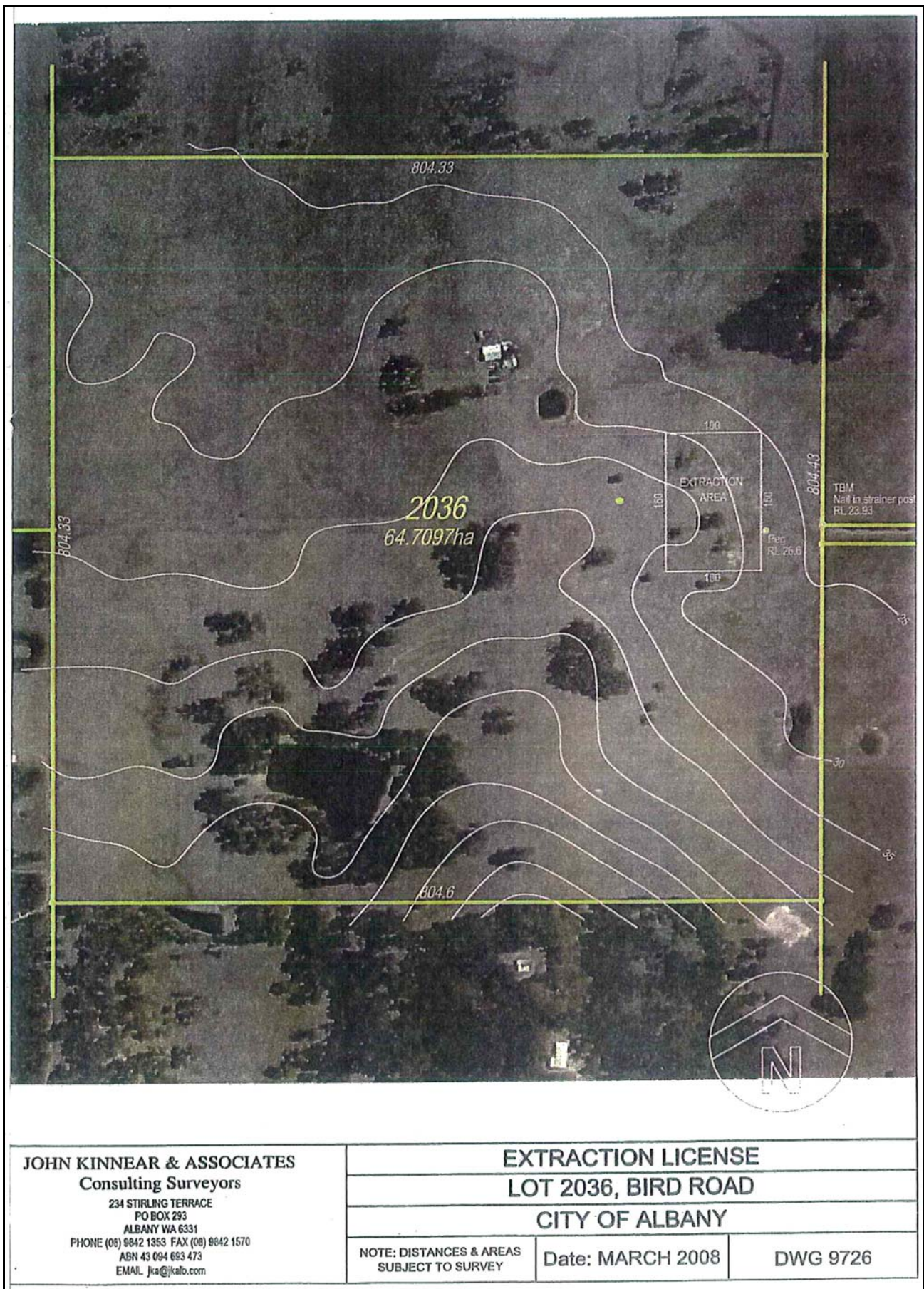
Figure 2: Proposal site