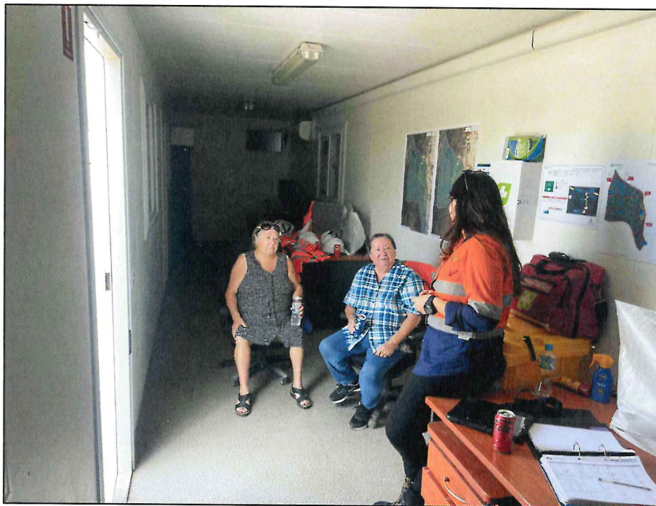
Figure 4: Group 2 onsite consultation