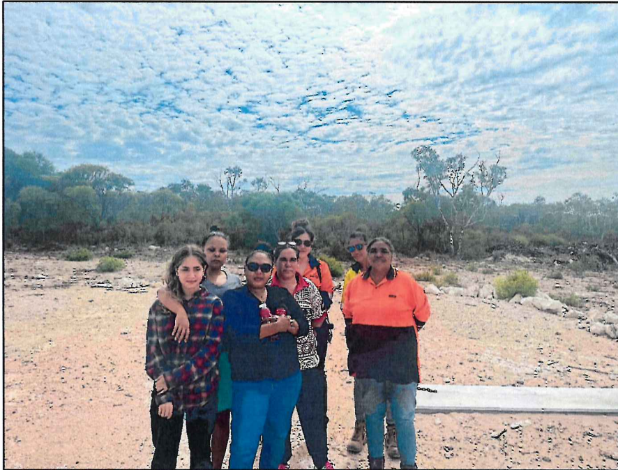
Figure 1: The group 1 site inspection team