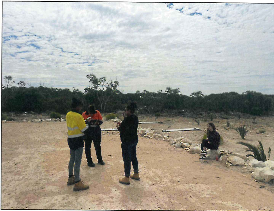
Figure 3: Group 1 onsite consultation