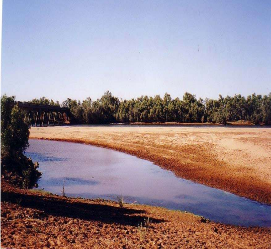
Plate 4.11: Riverine habitat of De Grey River (KP 76.17), where the species *Argemone ochroleuca , *Cenchrus ciliaris , *Cynodon dactylon , *Parkinsonia aculeata and *Indigofera oblongifolia occur amongst the Eucalyptus victrix woodlands.