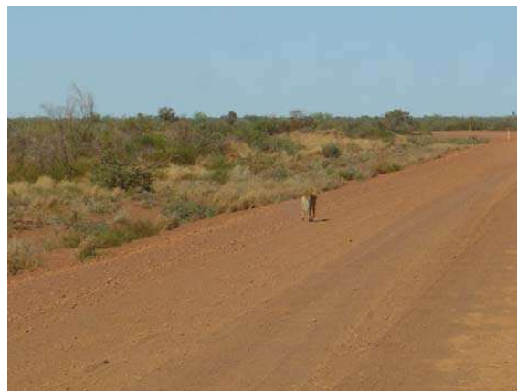
Plate 5.1 Dingo observed on side of Telfer Road.