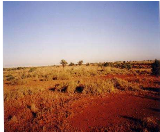
Plate 4.10: Habitat of Acacia glaucocaesia (KP 91.1).