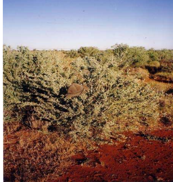
Plate 4.9: Acacia glaucocaesia (KP91).