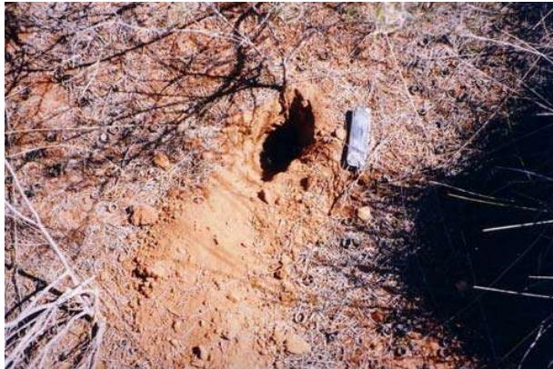
Plate 3.2: Bilby diggings observed along the pipeline corridor alignment.

A number of areas along the pipeline route were identified as suitable for Bilby occupation, between KP219 to KP221, KP228 to KP233, KP235 to KP239 and an area to the West of the major dune systems between KP310.16 and KP289.47. These areas were searched thoroughly for signs of burrow excavation, diggings and scats. Bilby activity was confirmed in the area to the West of the major dune systems between KP310.16 and KP289.47 where there were alternating sections of rocky substrate and mixed shrubland over Triodia sp. on soft sandy loam. In the sandy areas there were characteristic Bilby diggings (Plate 3.2) and a recently used burrow located at KP295.75 on the centre line of the pipeline corridor (Plates 3.3a and b). Bilby diggings are shallow cylindrical pits 5-20cm deep, and 5-15cm wide, where the soil is piled up in the direction of the mouths (Smyth and Philpott 1967).