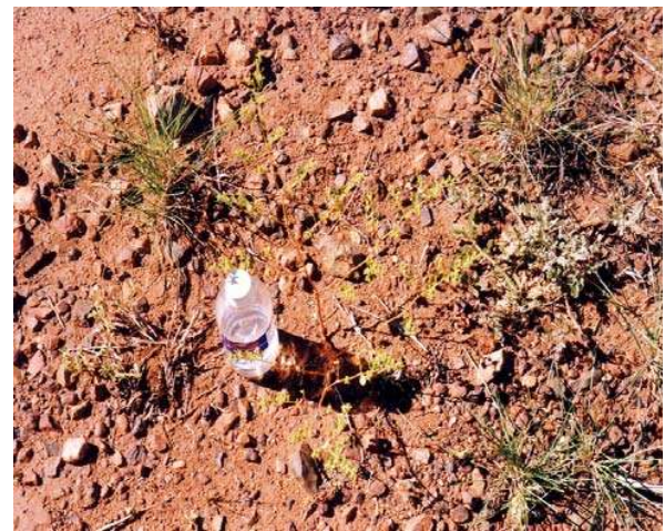
Plate 4.6: Euphorbia clementii (KP98).