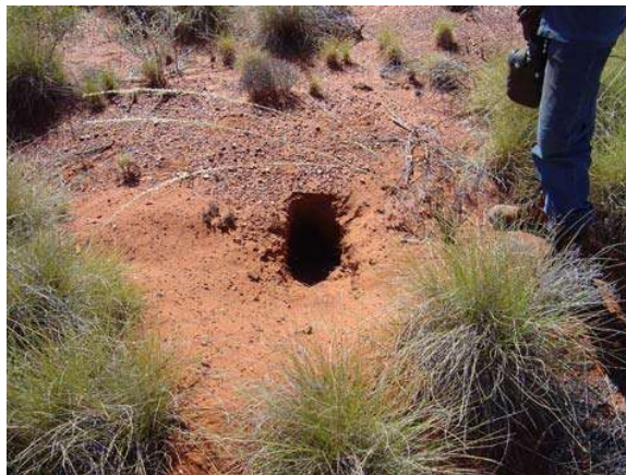
Plate 3.3a: Bilby burrow at KP295.75 on the centre line of the pipeline corridor.