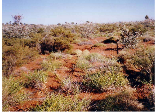
Plate 4.5: Habit and habitat of Goodenia hartiana (green shiny bushes in the foreground) (KP307.53).