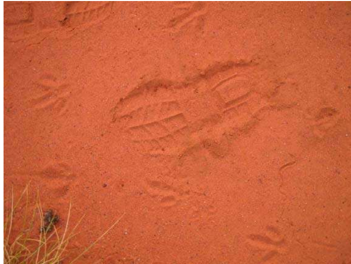
Plate 3.5: Bustard tracks near KP179.

The Australian Bustard is listed as a Priority 4 species. It is thought that alteration of its grassland habitats by grazing sheep and rabbits and predation by the fox has led to a decline in its number and range. Australian Bustard tracks were seen the entire length of the proposed pipeline route (Plate 3.5). The construction of the pipeline will not significantly impact this species.