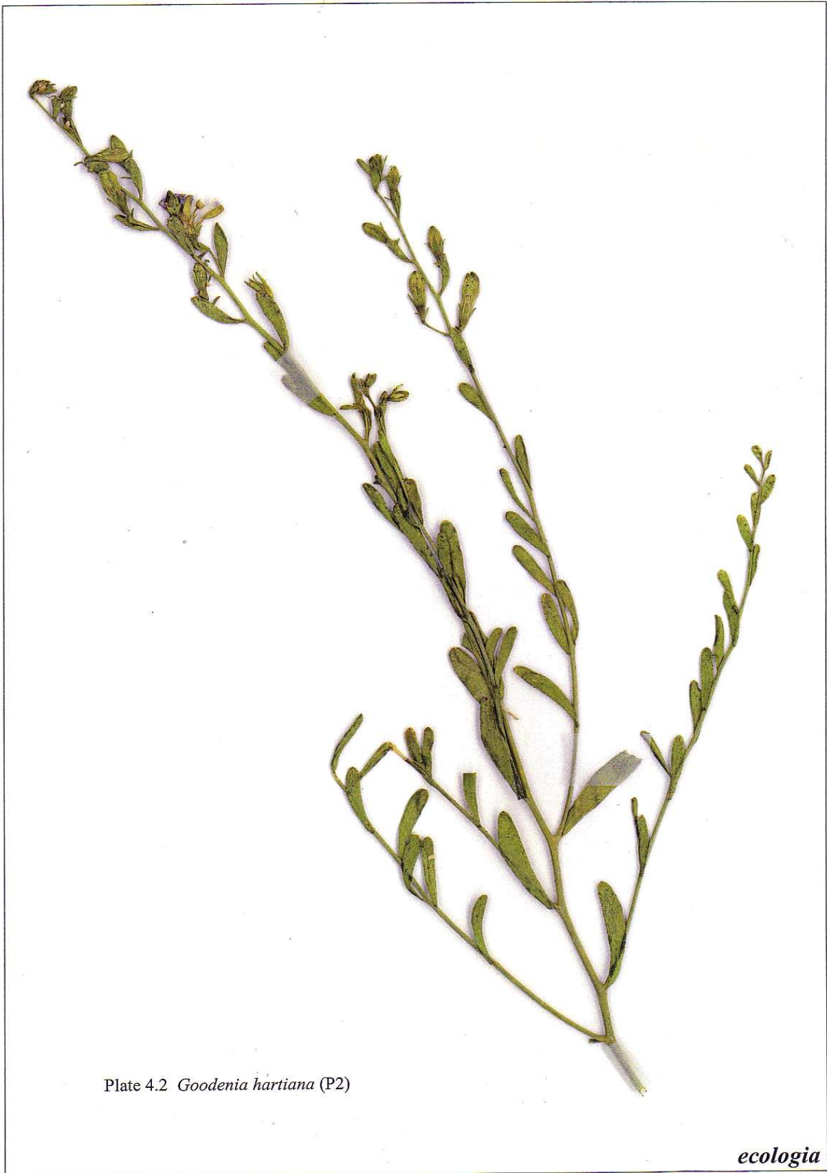
Plate 4.2 Goodenia hartiana (P2)