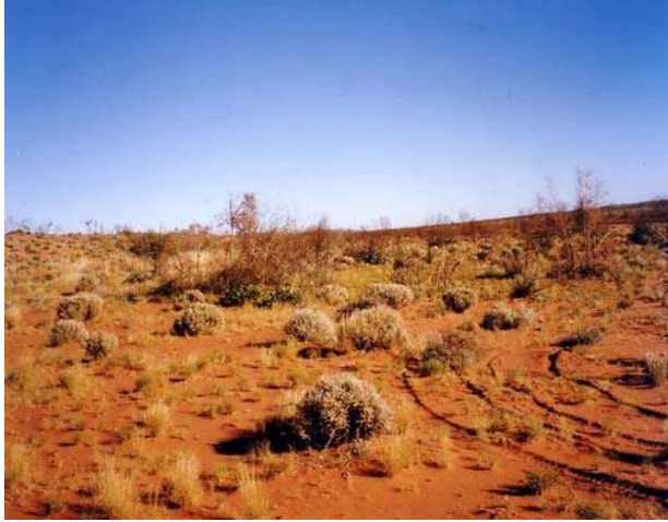
Plate 4.3: Habit and habitat of Dampiera atriplicina (round grey bushes) at the base of a sand dune (KP400.58).