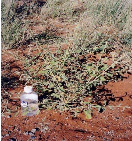
Plate 4.7: Abutilon trudgenii (KP 95).