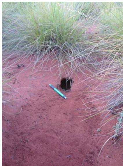
Plate 3.1: Mulgara burrow entrance at 0206793; 7738260.

Despite the abundance of suitable habitat no signs of Mulgara activity in the form of tracks, scats or burrows were observed in any of these areas apart from a single disused burrow entrance between KP176 and KP177 (Plate 3.1).