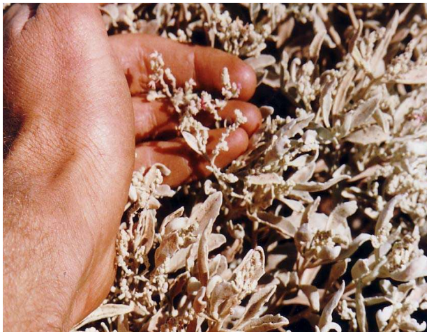
Plate 4.4: Flowers and foliage of Dampiera atriplicina (KP417.95).