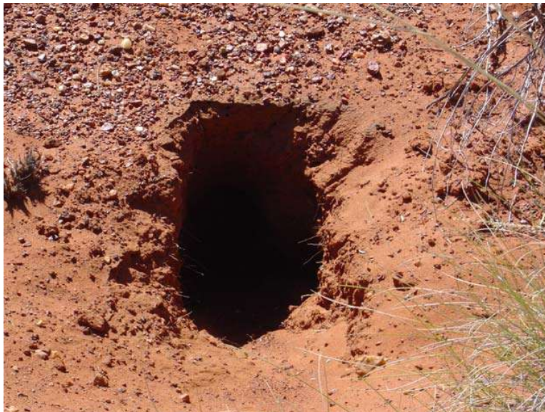
Plate 3.3b: Close-up photo of Bilby burrow at KP295.75 on the centre line of the pipeline corridor.