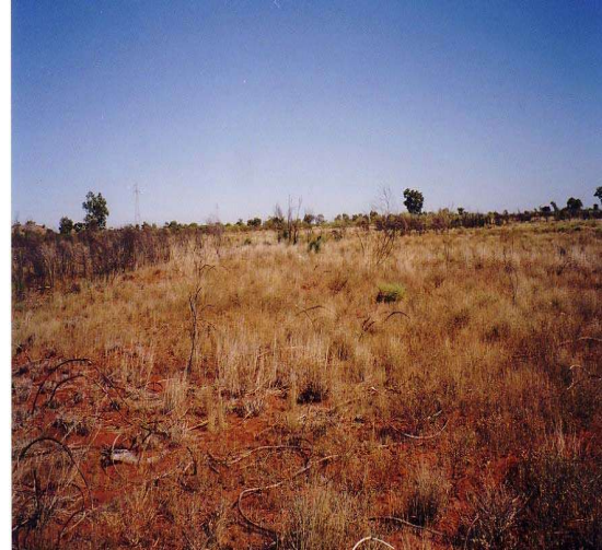
Plate 4.13: Habitat of *Cenchrus ciliaris (KP 97) adjacent to shallow loam creekline.