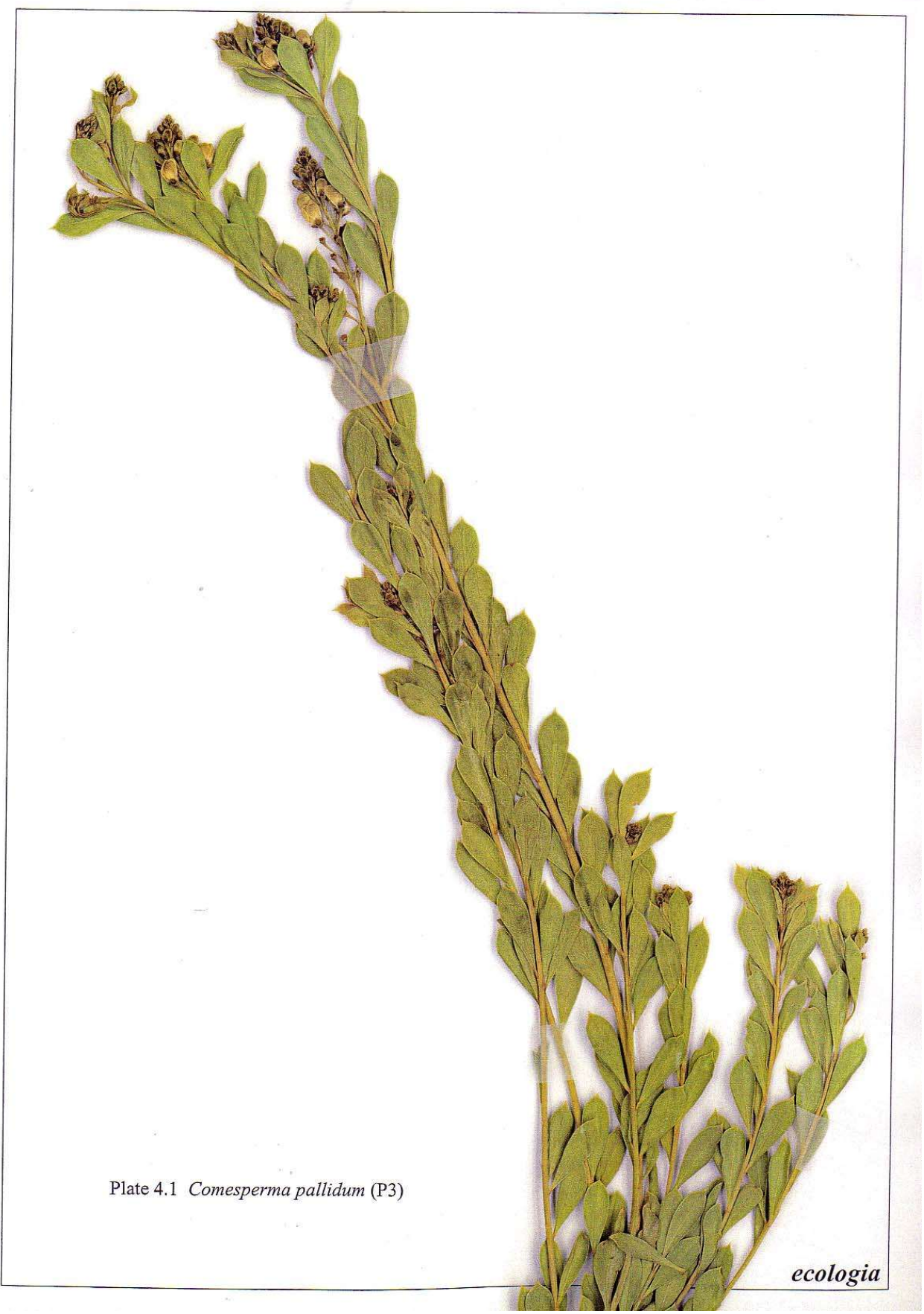
Plate 4.1 Comesperma pallidum (P3)